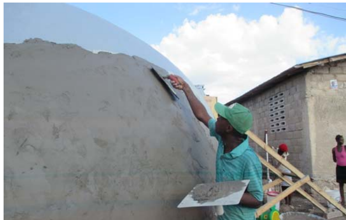
Applying the first coat of stucco.

We regularly requested that the stucco be wet down to help the curing. While it was regularly done, only small amounts of water were added until Lophane got up on the scaffold and started throwing 5-gallon buckets of water onto the surface.