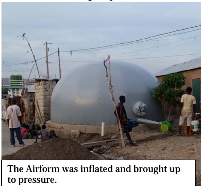
The Airform was inflated and brought up to pressure.