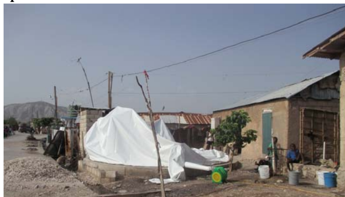
Erecting the Airform. Note the proximity to the sewer ditch, the adjacent home, and the community water well.

We returned in September to erect a 20-foot dome.