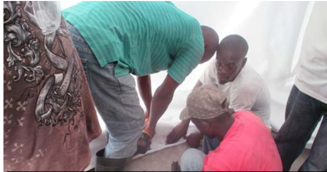
Attaching the Airform was done from the inside. Each crew member was trained to install the Airform.

Stub-outs were installed for water, electricity, and sewage. We hope that at some point in the future they will be able to be used for these purposes. Another purpose is to