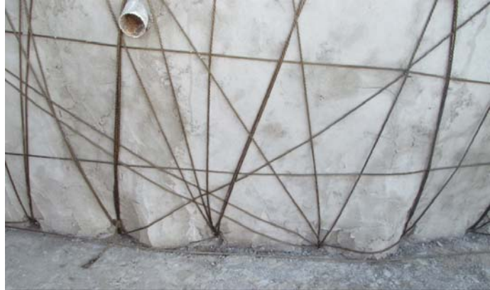
Vents placed and first coat of stucco wrapped with basalt rope.

After the first full coat was dry to touch, the dome was wrapped horizontally, vertically, and at about a 45 degree angle with basalt rope. To make the wrapping easier and to do it without having to get on the roof, the rope was passed through a section of 1 inch PVC pipe. That way a person could stand on the ground and accurately place the rope. The pipe used was Schedule 20, and it was more flexible than desired. Schedule 40 would have been better, but it was not available. Even though the instructions called for using 1.6 rolls of rope, 2.5 rolls were used. To hold the basalt rope in place, 4- and 5-inch zip ties were used. Additionally, the window buck was held in place by rope from it to each of the door frames and with rope over the top of the dome.