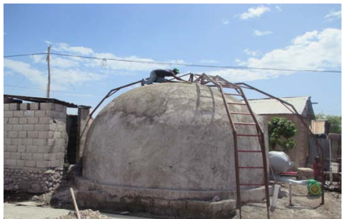
Applying the third coat of stucco.

We sent two of the crew up on top of the dome to add the turbine neck to the turbine base. Problems developed, in that extra stucco had been added to the turbine base and it needed to be chipped out before the neck could be added. What we did not realize at the time was that the crew had mounted the base upside down. When the third coat of stucco was applied, the neck was fixed permanently into place. This was a case of we needed to practice putting a turbine together on the ground so the